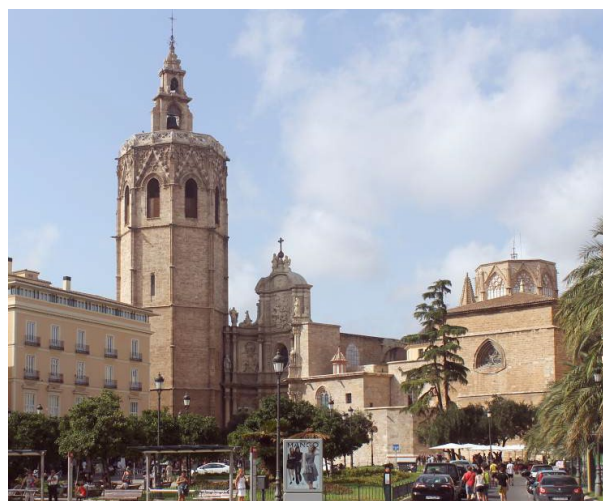
(a) (VAR Figure Sub-caption)

Table captions must be fully informative. Please realise that for the first row of the table, the VAR Table First Row (Arial font, size 8, centred, italics) will be used (Table 1); for the cell values, VAR Table Data (Arial font, size 8, centred). Hide all gridlines except both the first bottom row and the left and right central column.