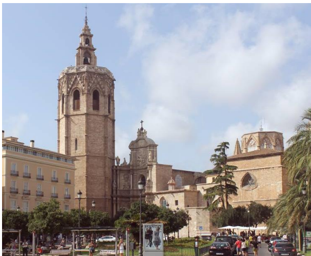
(a) (VAR Figure Sub-caption)

Cross-references should not be linked to figures; only plain text.