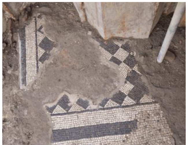
Figure 9: Room E, decorated with a checkerboard mosaic.