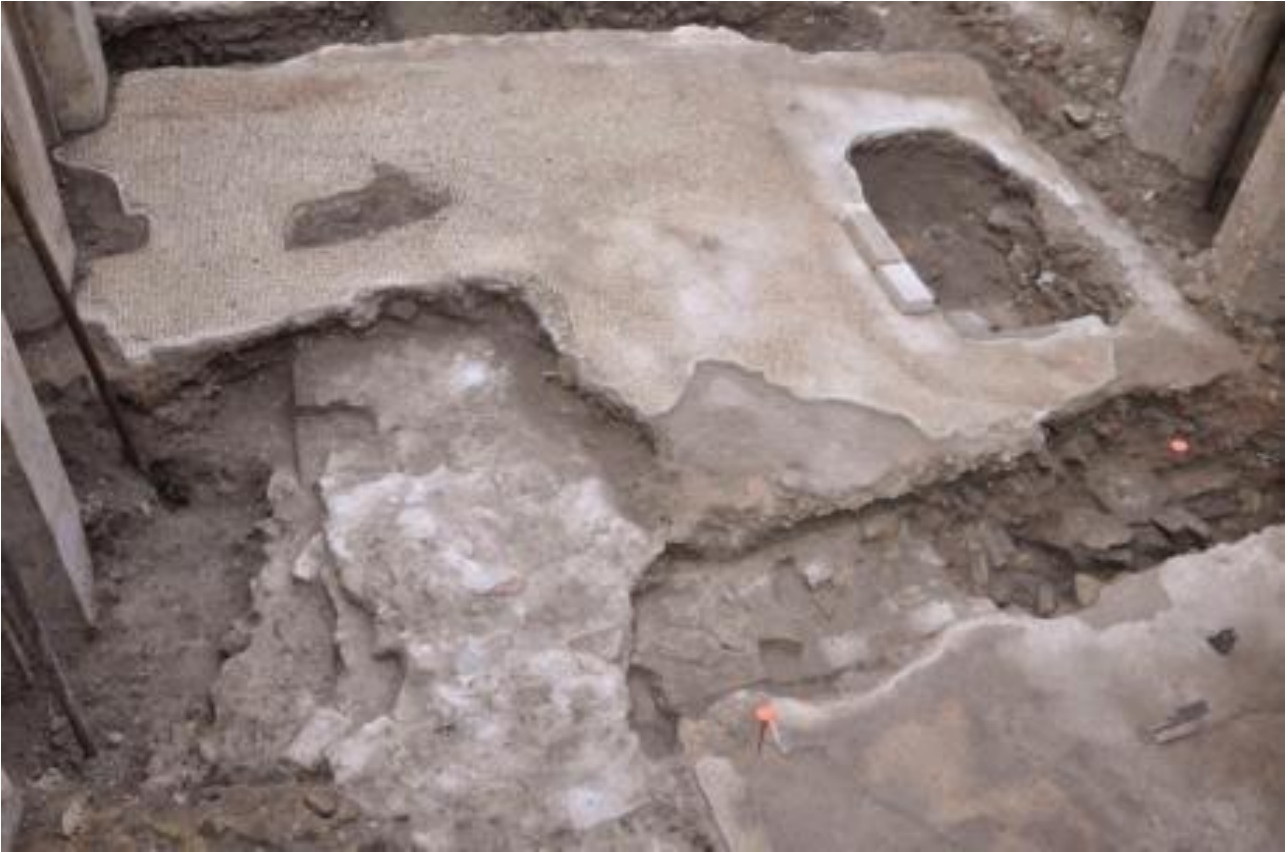
Figure 2: Central room (C) with well and white mosaic.