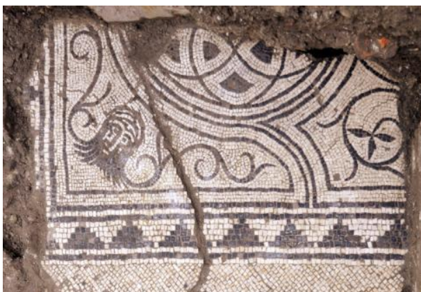
Figure 5: Room B, decorated with the so-called "Neptune" mosaic.