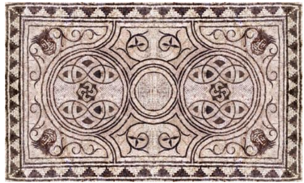
Figure 6: Virtual restoration hypothesis for room B (ca 2.8 x 1.5 m).