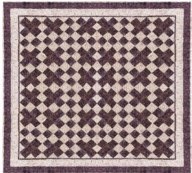
Figure 10: Virtual restoration hypothesis for room E (ca 2 x 2 m).

The poor residual mosaic surface was sampled in order to fill the lacunae and the rebuilt parts were replicated up to recreate the entire mosaic floor (Fig. 10).