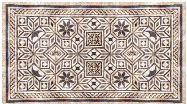
Figure 8: Virtual restoration hypothesis for room D (ca 4 x 2 m).