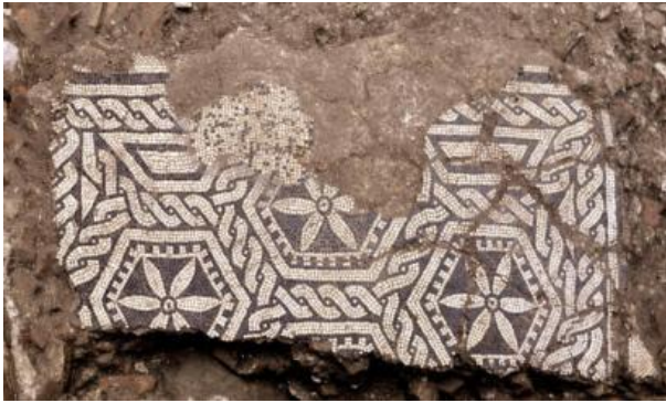
Figure 3: Room A, decorated with a hexagon mosaic.

The same procedure was applied in order to reconstruct the lacking parts of the frame and of the braided motif surrounding the hexagons.