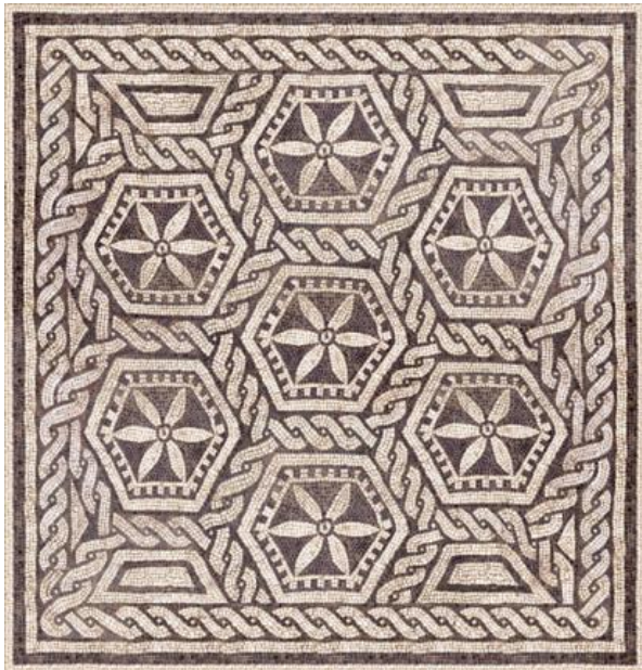
Figure 4: Virtual restoration hypothesis for room A (ca 2 x 2 m).